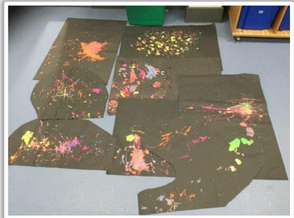
Seasonal pictures from SG2 Class.